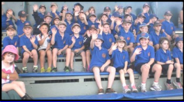
K/1/2 at Dolphin Magic enjoying their excursion.