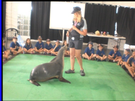
3/4/5/6 having lots of fun at camp!